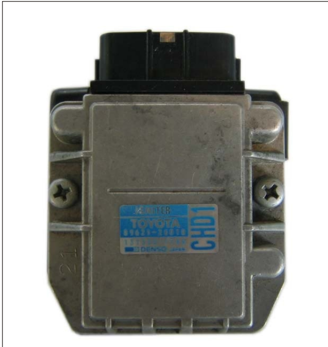
Figure I08.1 - Toyota 1UZFE Igniter